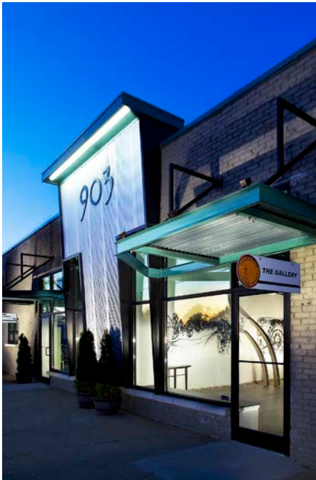
903 MANCHESTER GALLERY

PRP can provide an Option Analysis and Report (OAR) to assist with determining feasibility and fit in any urban environment.