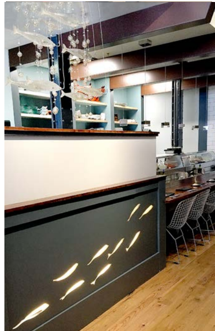
SCHOOL SUSHI RESTAURANT