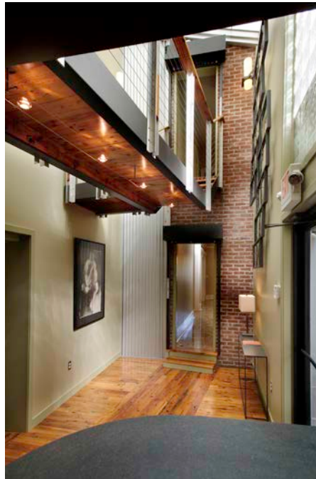
HELMERS + ASSOCIATES OFFICE